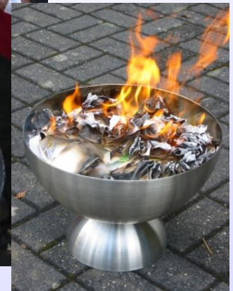
Life experiences – brought before God